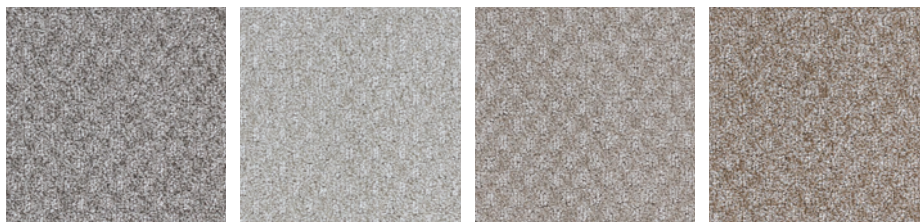
1606 Earth Dance